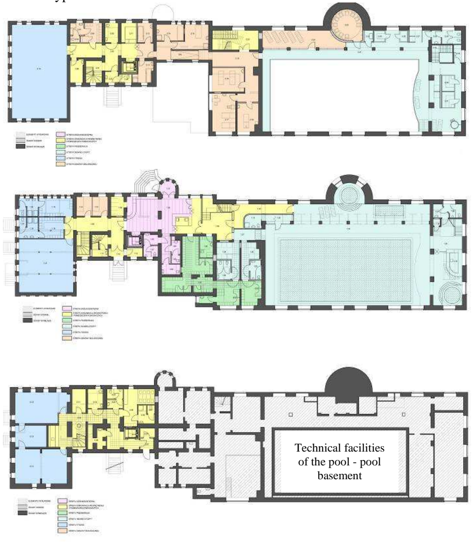
Fig. 1. Plan of the basement, ground and first floors of the building (bottom to top) - the original concept illustrating the distribution of planned functional zones in the facility (based on the conceptual design - from the author's archive)

conservation authorities, which, despite its dominant position sometimes took into account the designer's opinion and investor's expectations, which can be exemplified by consent to the installation of modern basins of stainless steel and, hence, resignation, in the pool basin, of non-functional lower flows to the modern type of Finnish flows.