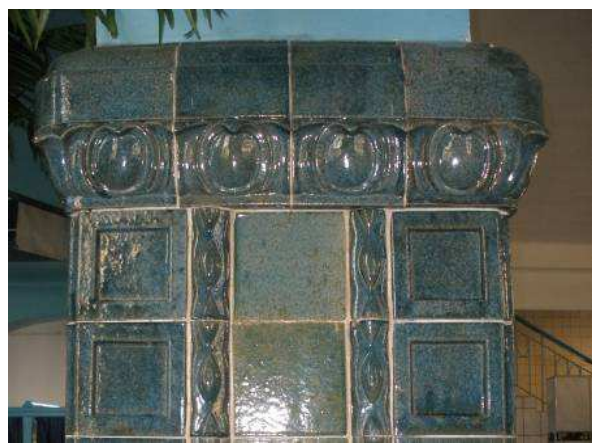
Fig. 4. Head of the pillar ceramic body of the ground floor arcade in the pool hall

These elements required a full technical and aesthetic maintenance, the most important was the maintaining of a beautiful ceramic wall lining, as an element having the greatest impact on the character of the interior. However, assuming lining to be left intact, one failed to avoid minor construction intervention caring with it the need to recover many of its elements, based on the prepared documentation.